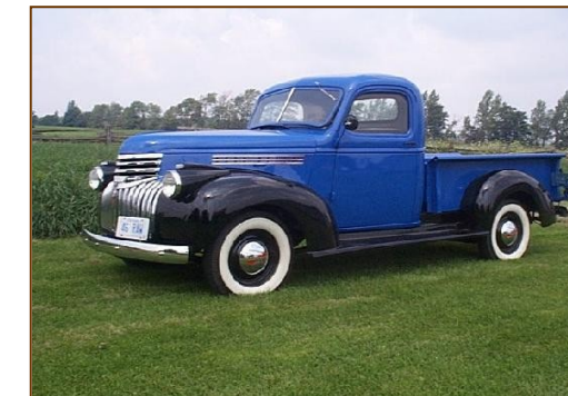
Our truck did not look this good, but when the new buyer restores it, it will look this good.