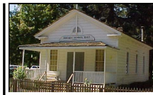
Rhoads School Established 1872